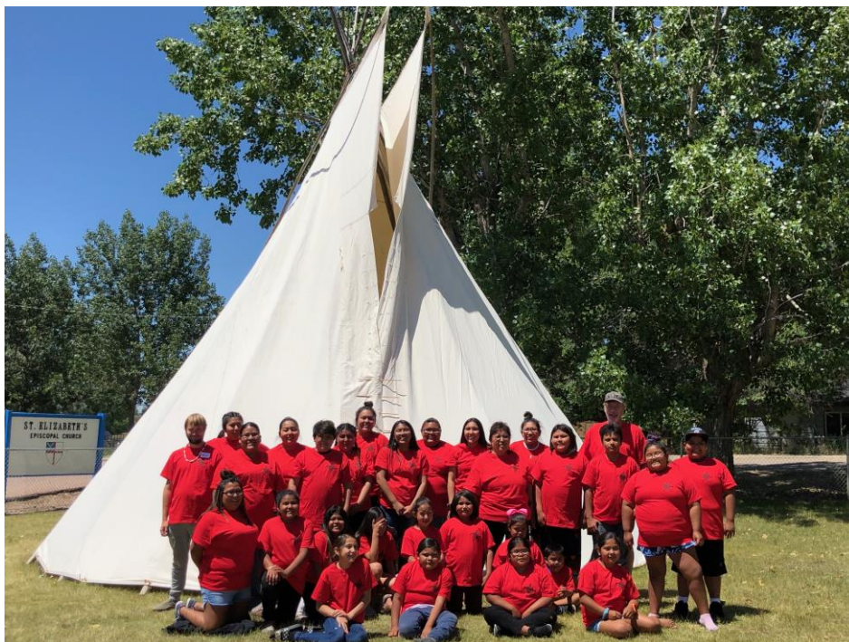
Arts-Kids & Arts-Teens Summer Camp