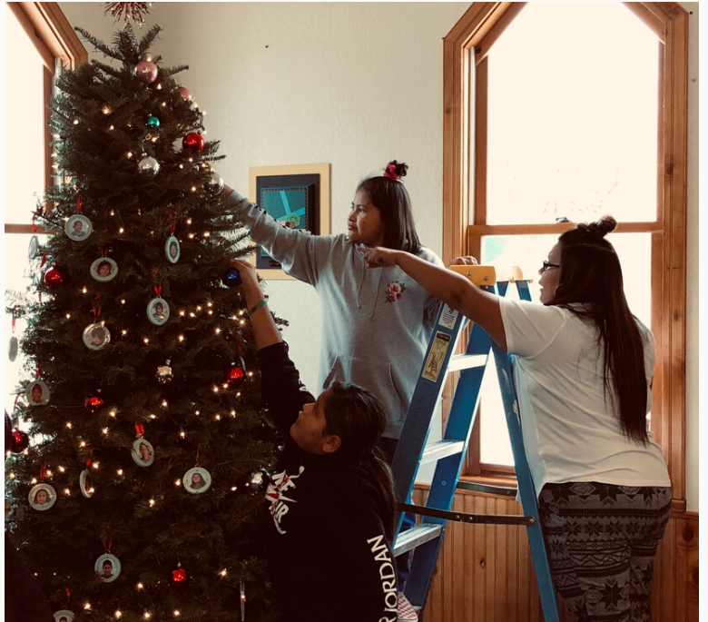
A beautiful Christmas Eve service in Whiterocks!