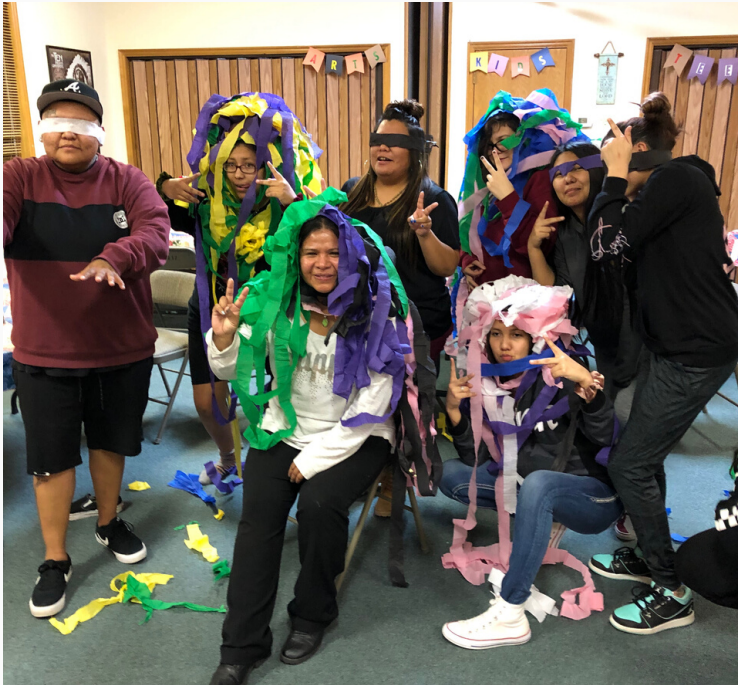
Two rules for Youth Group: Be Safe and Have Fun!