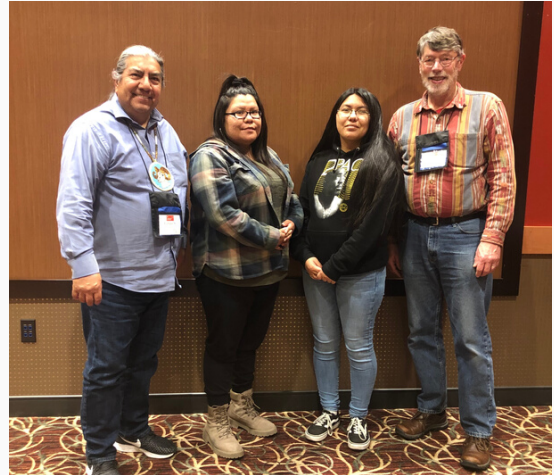
St. Elizabeth's at Winter Talk