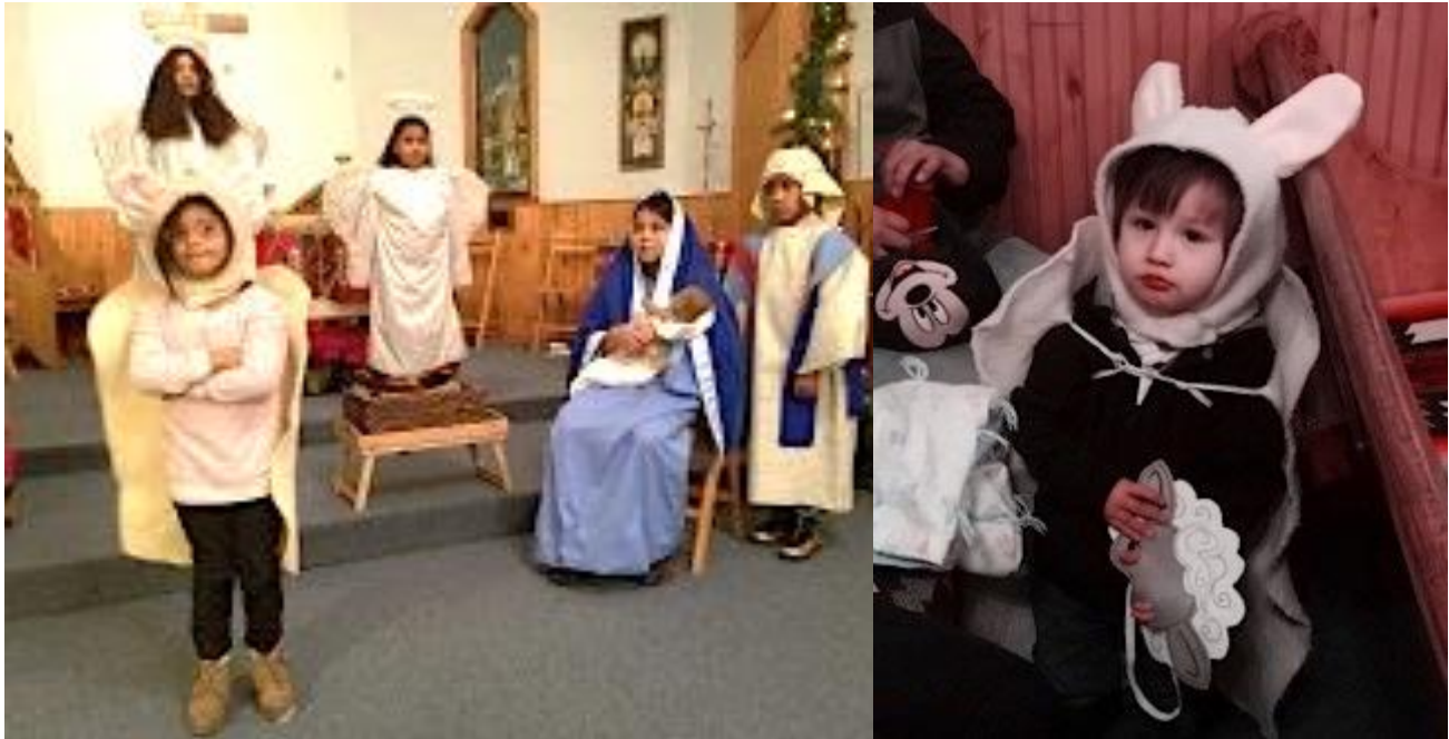
There's no other night in the church quite like Christmas Eve, with beautiful decorations and carol-singing by candlelight. We had a wonderful celebration with a lovely children's Pageant, refreshments and gifts afterwards.