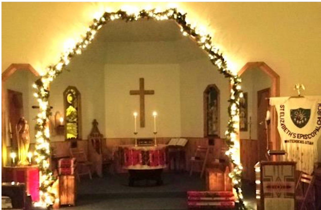
Many thanks to the people who made this possible and to everyone who shared in the Christmas joy at St. Elizabeth's!