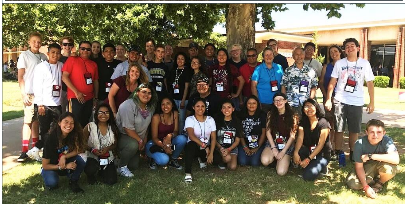
Imagine a group like this spending the weekend at St. Elizabeth's... Don't miss the Diocese of Utah's Spring Retreat in Whiterocks on May 4-5!