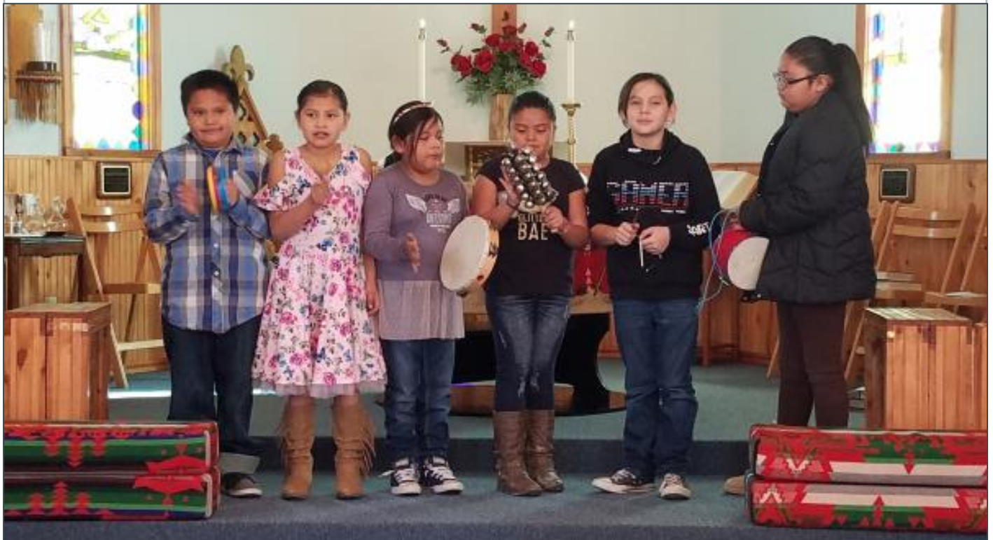
Children joyfully accompanied the final song last Sunday.