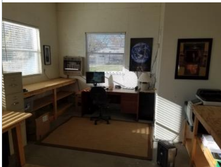
The church office is now located in the former "shop" on the west side of the Vicarage garage.